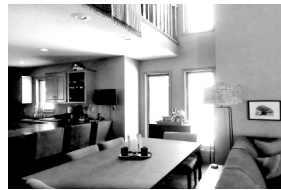
982 Sunrise Beach Drive