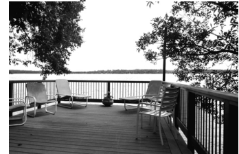
756 Cty Rd. F

Check out our new MAP SEARCH TOOL on www.lakewapogasset.com - 'Property for Sale' page. All WBT properties FOR SALE are shown on a lake map ... click the photo for complete MLS listing sheet/price info.