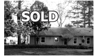
738 So. Shore Dr.