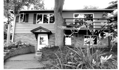
721 Hickory Point Lane