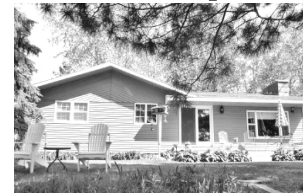
718 Bear Trap Lane