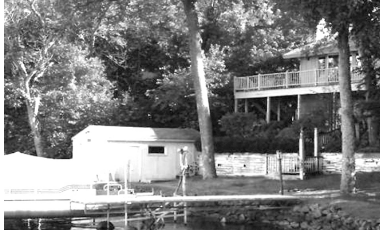
1283 South Shore Ct.