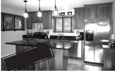
730 Bear Trap Lane