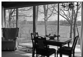
806 Flo's Court