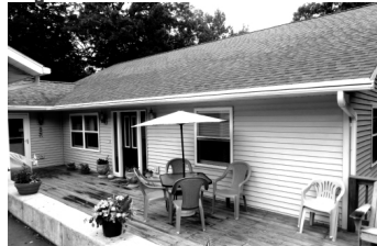
669 Bear Trap Court